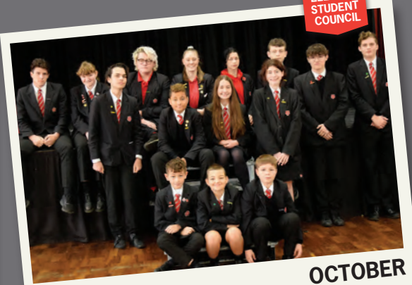
ELECTED STUDENT COUNCIL