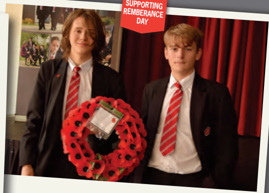
SUPPORTING REMEMBRANCE DAY