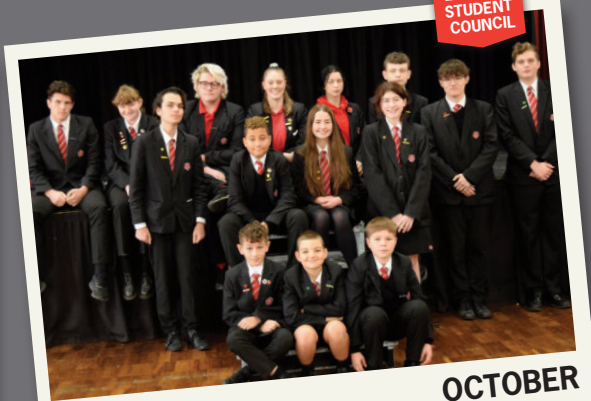
ELECTED STUDENT COUNCIL