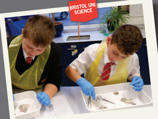
BRISTOL UNI SCIENCE