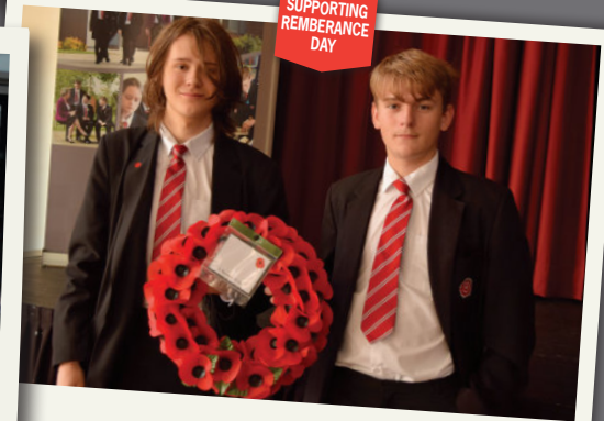
SUPPORTING REMEMBRANCE DAY