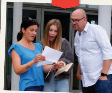
YEAR 11 RESULTS DAY