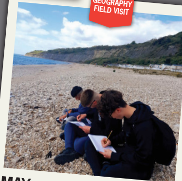
GEOGRAPHY FIELD VISIT