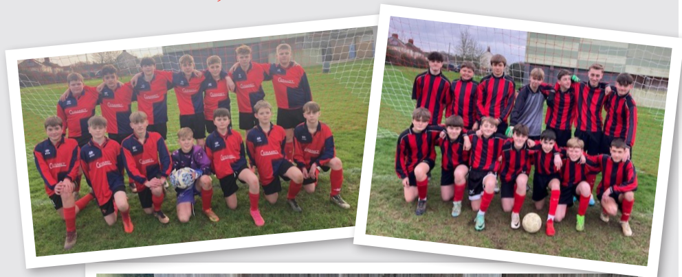
Years 7, 8 and 9 Football teams